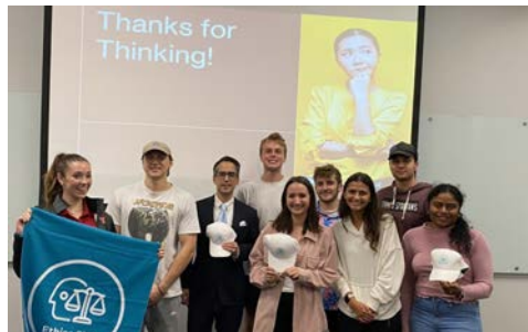
2023 Ethics Club meeting.