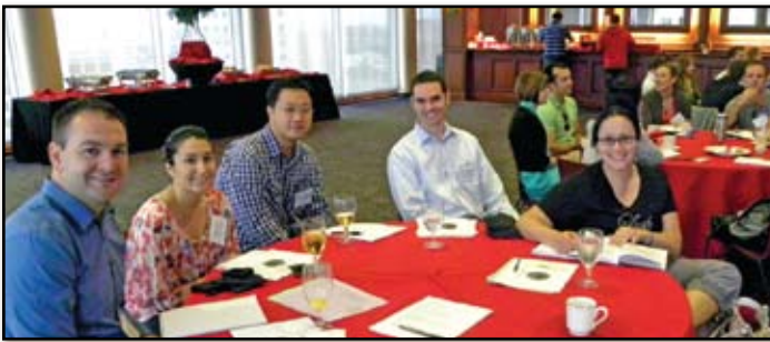
Participants of our Level I Leadership Development Certificate Program.