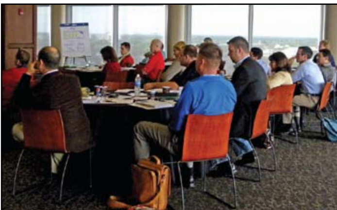
Attendees listen attentively during the Dynamic Leaders (Level II) Leadership Development Certificate Program which was held April 11-13, 2012.